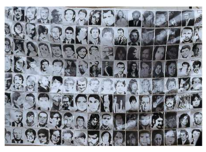
Los Desaparecidos: Chileans disappeared by Pinochet's regime