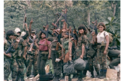
Galil rifles from Israel.