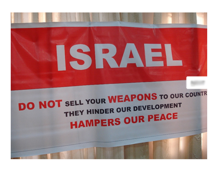
Banner at disarmament conference in India.