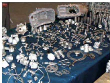
Israeli arms sold to Iran during the Iran-Contra scandal.

• In Iran during the rule of the Shah, Israel served to protect this brutal U.S. puppet regime. In turn, the Shah was one of the first leaders in the region to recognize Israel as a state. <sup>56</sup> During the Iranian Revolution that overthrew the Shah, Israel sold over 150 million U.S. dollars in arms to the regime. <sup>57</sup>